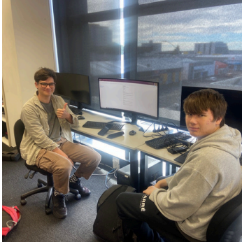
EmployNZ students learning about IT Support

It's been a real highlight this term to visit courses in action and see firsthand how engaged and focused our students are. Whether they're welding, designing, building, diving, styling hair, or prepping food, it's clear they're gaining practical skills and confidence in real-world environments. These visits are a powerful reminder of the incredible opportunities Futures Academy offers—hands-on experiences that not only build technical knowledge, but also open doors to exciting future pathways.