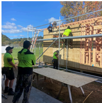
Te Kakau o te Toki Construction Academy, building a house for kainga Ora, through Whakatane High School