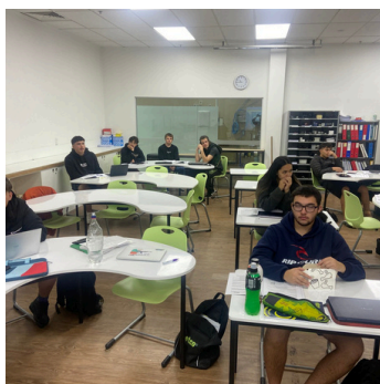
ETCO students doing their bookwork in Rotorua