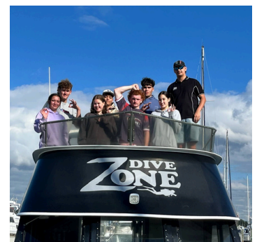
Dive Zone students getting ready for a scuba dive