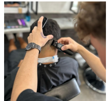
Hair to Train students getting creative