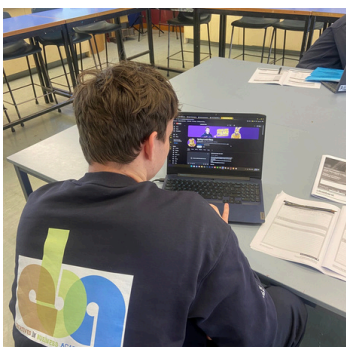
Creatives in Business Academy (CBA) students learning to monetise their creative interests!