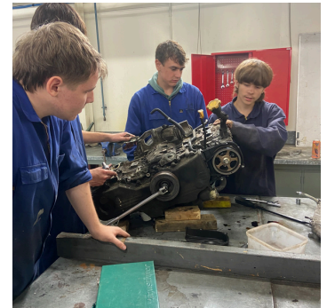
Automotive Engineering course run through Toi Ohomai