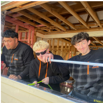
Allied Trades Training Course run through Trident High School