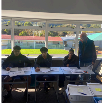
Te Wananga o Aotearoa, Building & Construction project at Ruatoki High School