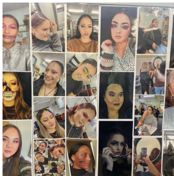
Students from Toi Ohomai Whakatane Hair and Beauty Course