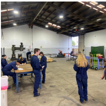
Patchell Engineering students doing work-based training