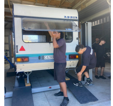
Caravan Restoration course run by Tarawera High School